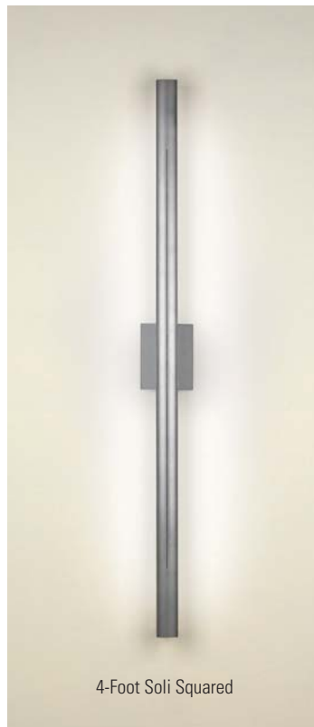
4-Foot Soli Squared

The Line is captured by the Square. Soli Squared is a stylish variation on Soli Line. Together they create a vision of light and precision. Soli Square cleverly covers the J-Box while adding another element of refinement.