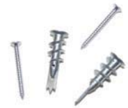
Drywall Anchors and Screws