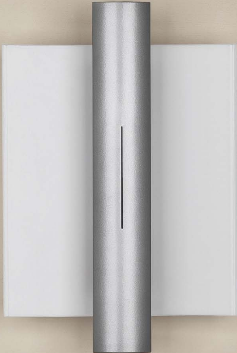
Soli Sconce Acrylic

Soli Sconce For Compact Fluorescent Lamps