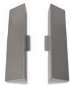
Cast Decorative J-Box Cover